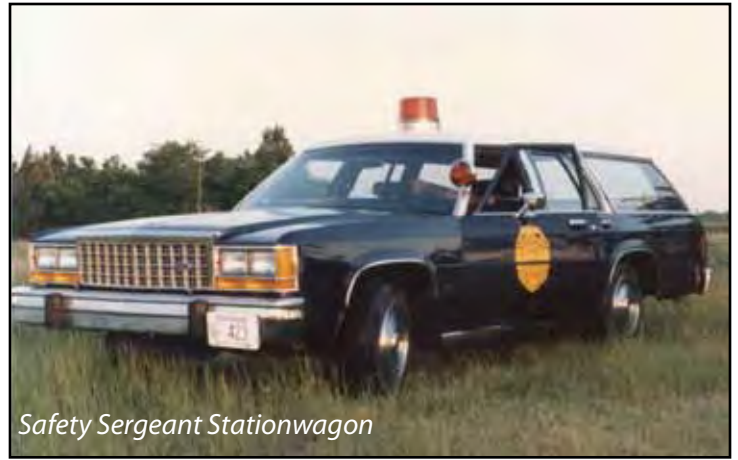
Safety Sergeant Stationwagon

Ford is introducing a completely new Police Interceptor in 2013 to replace the Crown Victoria. The new Police Interceptor is based on the sixth generation Ford Taurus platform, featuring several V-6 engine options, which